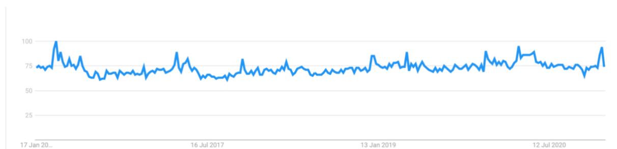
5-year trends for "Kiwi" keyword

The trend of a keyword is another important factor of the keyword-base factors. It is important to understand and follow the trends to appraise and determine a pricing of a domain name properly.